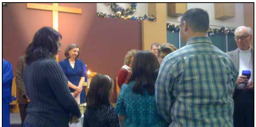
Recent communion service.